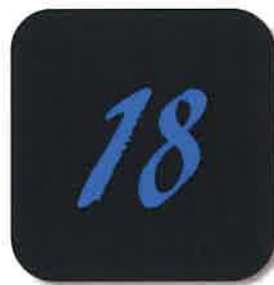
Now You Are 18